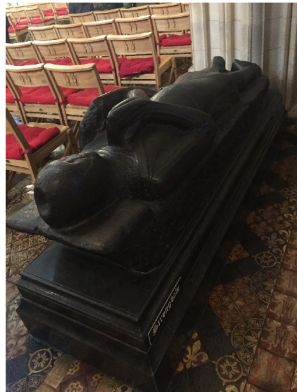
Alleged tomb of Strongbow, though many scholars in doubt. Photo taken October 2018

elected Archbishop of Dublin at the Synod of Clane. At the time, Dublin was still under the control of the Danes and Norwegians, as Dublin had been settled first by Viking raiders. Lawrence worked with them to establish peace and harmony in his new diocese. He continued working to renew the Irish Church and bringing about liturgical reforms in line with Roman practice. He was again noted for his care and concern for the poor and established several centers for the care of orphans. He also began a building campaign and laid the cornerstone of the Cathedral of the Holy Trinity, now known as Christ Church Cathedral, famous for containing the reputed tomb of Strongbow, (Richard de Clare, the 2 nd Earl Pembroke) the Norman English "Conqueror" of the Vikings of Dublin.