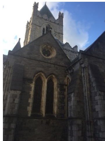
Bell tower of Christ Church Cathedral. Photo October 2018

One of my favorite places to visit in Dublin is Christ Church Cathedral, dating back to the eleventh century. It is located near the Wood Quay on the River Liffey in what was the heart of Viking and then Medieval Dublin. While not as celebrated as nearby St. Patrick Cathedral, which was built later, it nonetheless serves as the Seat of the Catholic Bishop of Dublin at least in name, through it is controlled by the Church of Ireland and serves simultaneously as the Seat of the Archbishop of Ireland of the diocese of Glenadalough and Dublin. I was intrigued upon visiting Christ Church the first time to find a chapel dedicated to the memory of St. Lawrence O'Toole, of whom I knew nothing at the time except for his name.