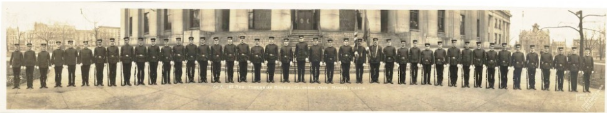
Company A, 1 st Regiment, Hibernian Rifles, Columbus, Ohio, March 17, 1914