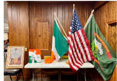
AOH Information Table