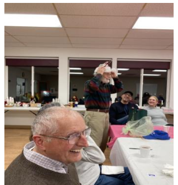
Gift #2 – a sparkly Christmas hat!