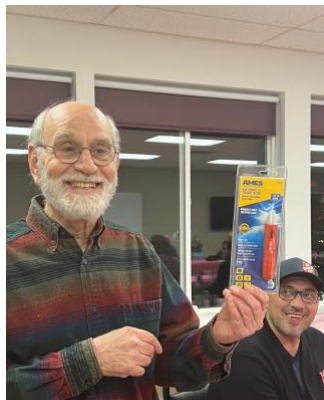
Brock stole the hat – but this is a keeper!