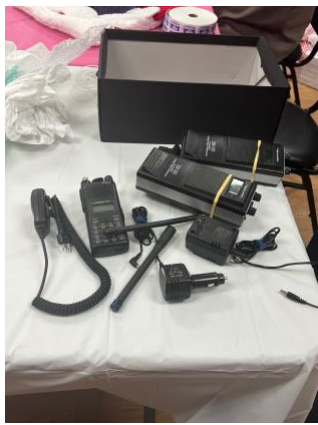
White Elephant Radio Parts ... perfect!