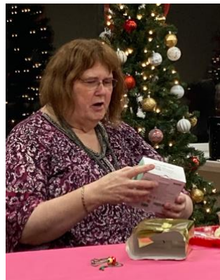
She is trying to figure out what is in this!