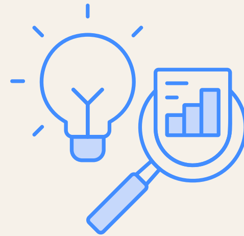
ANALYTICS & INSIGHTS