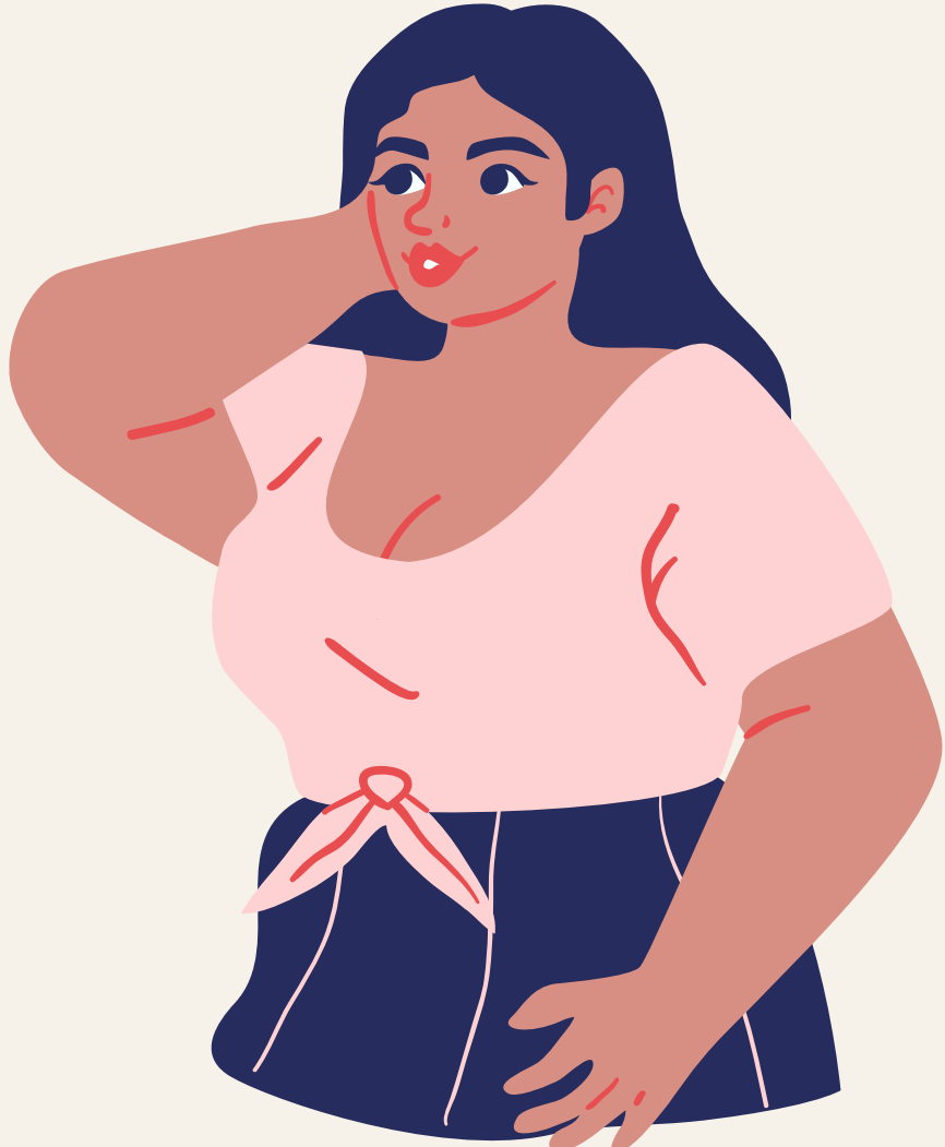
TOP SELLING PRODUCTS