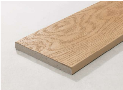
Envello Reveal Board

Antique Oak: MCPTF50A Smoked Oak: MCPTF50D Golden Oak: MCPTF50G Burnt Cedar: MCPTF50R Limed Oak: MCPTF50L Jarrah: MCPTF50J