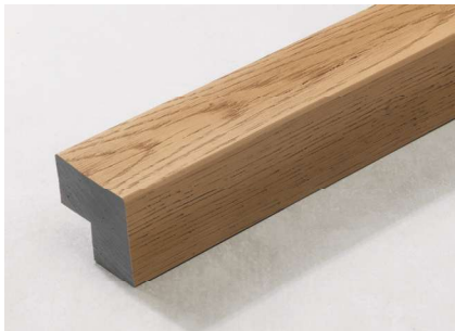
Envello Square Corner Trim

Width: 2" (50mm) Thickness: 2" (50mm) Length: 120" (3050mm) Weight: 20lb (9.1kg) Construction: Flexible polymer system