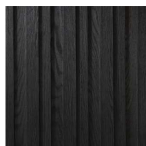
Burnt Cedar MCBF360R