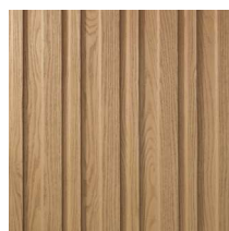
Golden Oak MCBF360G