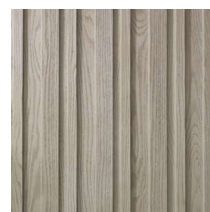
Smoked Oak MCBF360D