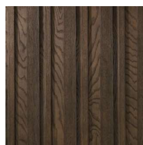
Antique Oak MCBF360A