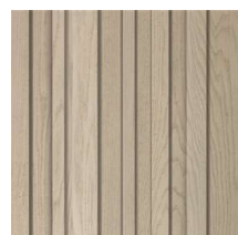
Limed Oak MCBF360L