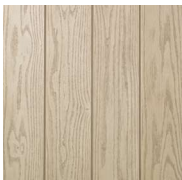
Lined Oak: MCL360L