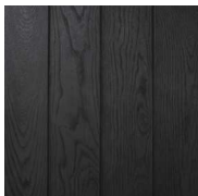
Burnt Cedar: MCL360R