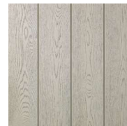
Smoked Oak: MCL360D