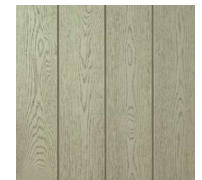
Sage Green: MCL360N