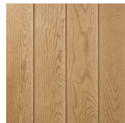
Golden Oak: MCL360G