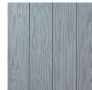
Salt Blue: MCL360T