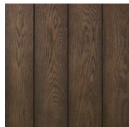
Antique Oak: MCL360A