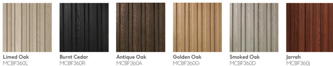
Figure 4. Available Colors for Board & Batten + Profile