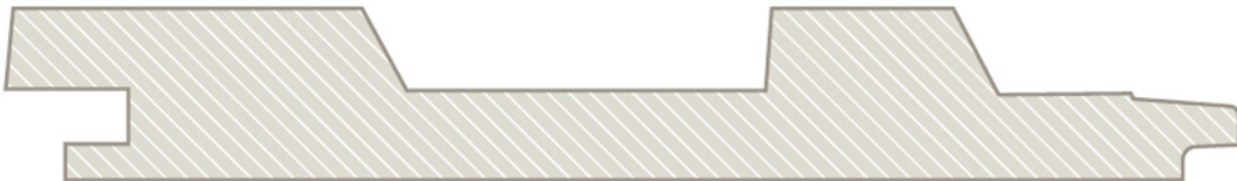
Figure 2. Board & Batten + Siding