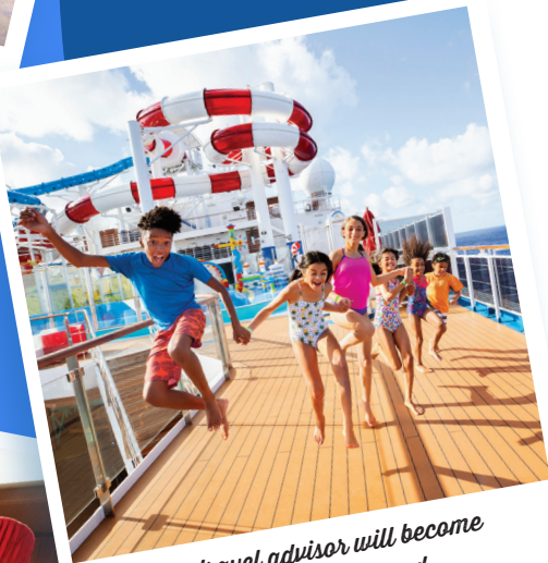
Your travel advisor will become your kids' best friend