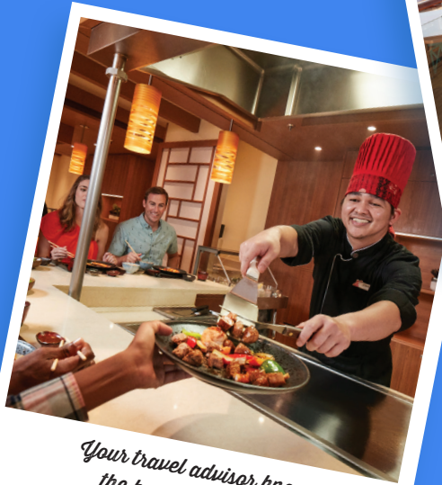
Your travel advisor knows the best dining times!