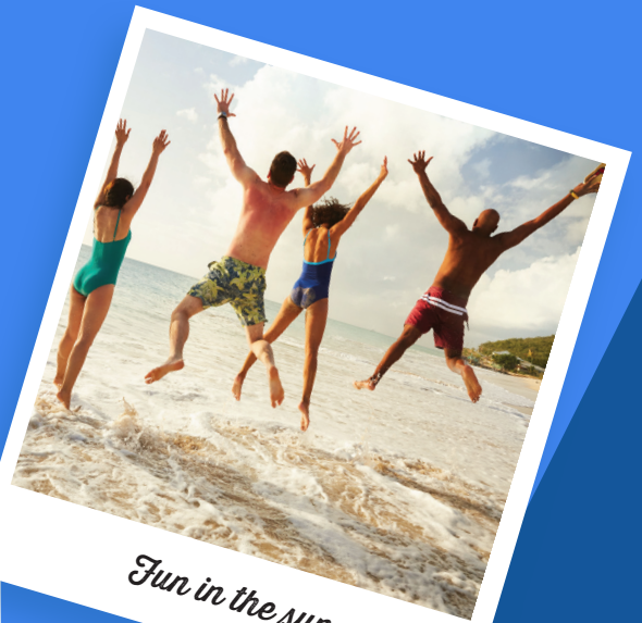
Fun in the sun