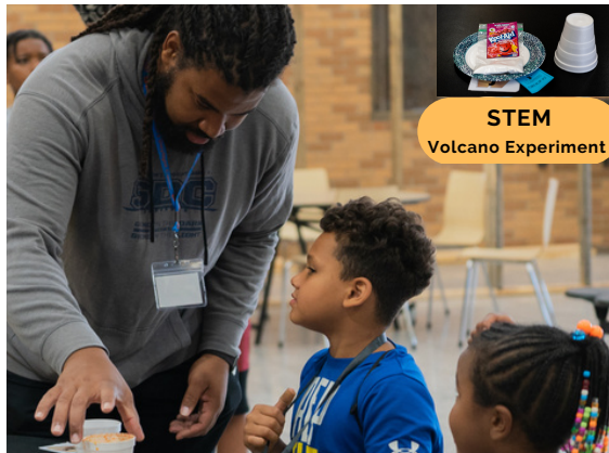
STEM Volcano Experiment