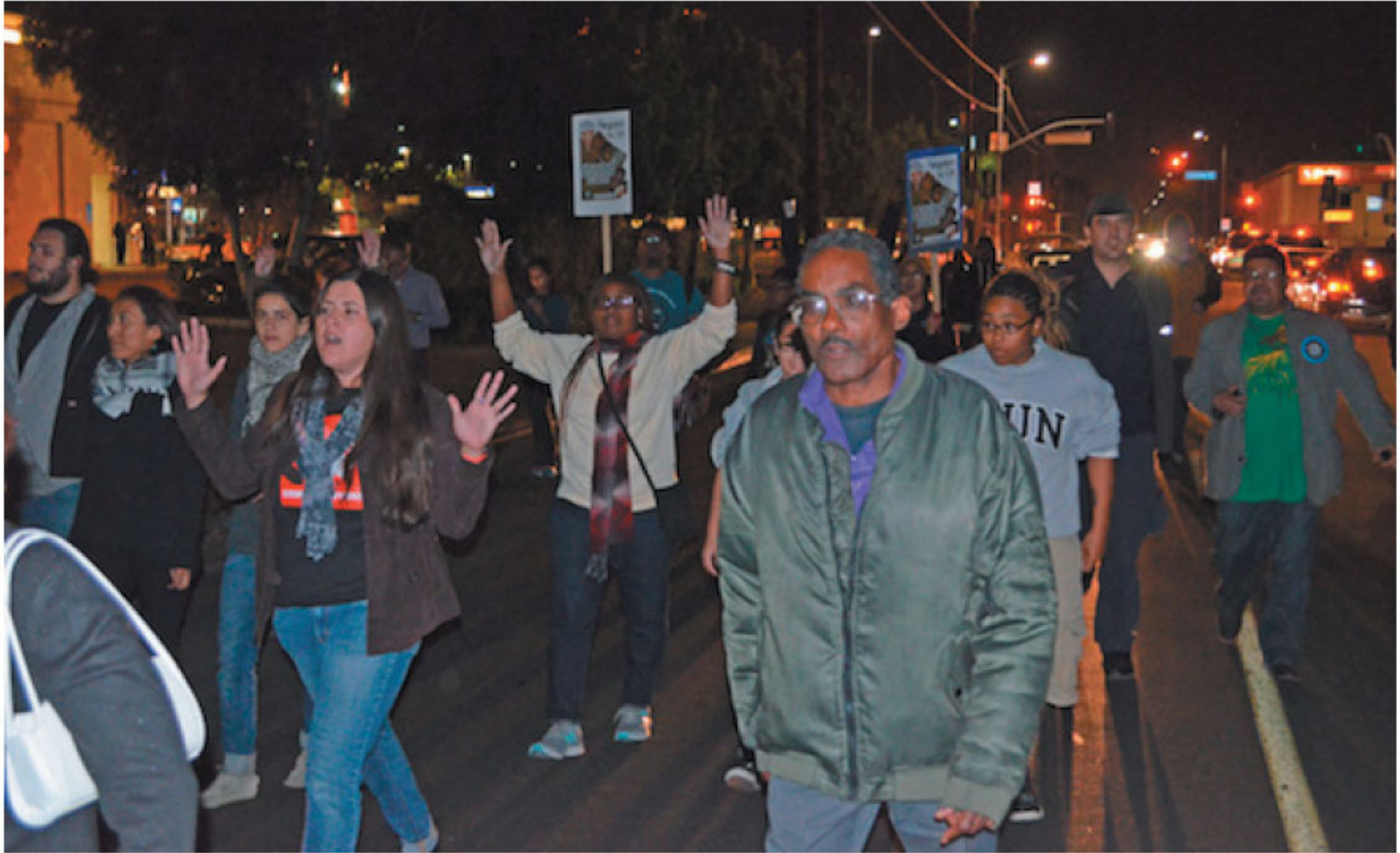
Protesters in Los Angeles respond to the non indictment of Officer Darren Wilson for the killing of unarmed teenager Mike Brown.

Violence and protests erupted across the nation this week after the announcement came that “no probable cause exists” to file any indictments against officer Darren Wilson for “any crimes related to the death of 18-year-old Michael Brown.” The announcement came during a November 24 press conference revealing the grand jury’s decision in the Ferguson, Missouri case. Wilson, a white officer faced trial for shooting to death Michael Brown, an unarmed black teenager in August of this year, putting the city of Ferguson at the forefront of the nation’s civil rights agenda.