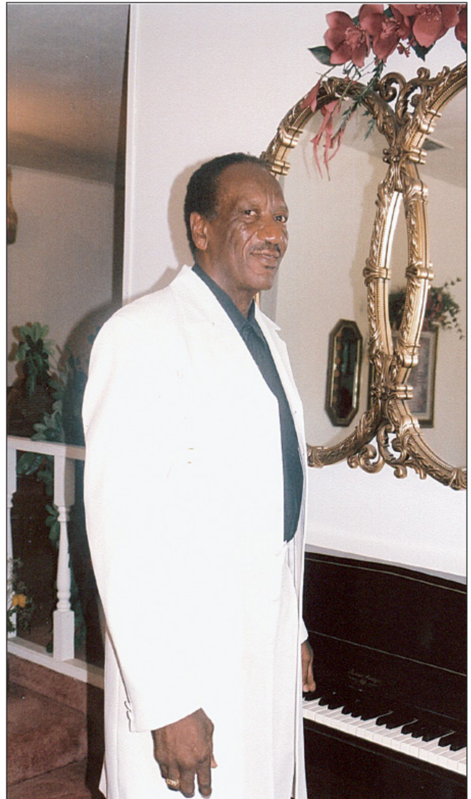
See Cover Story page 3