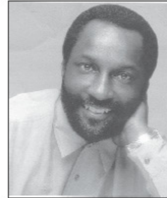
Minister Luther Barnes National Recording Artist

July 13, 2008 - 3:00PM Harvest Church Crockett, Texas and many others