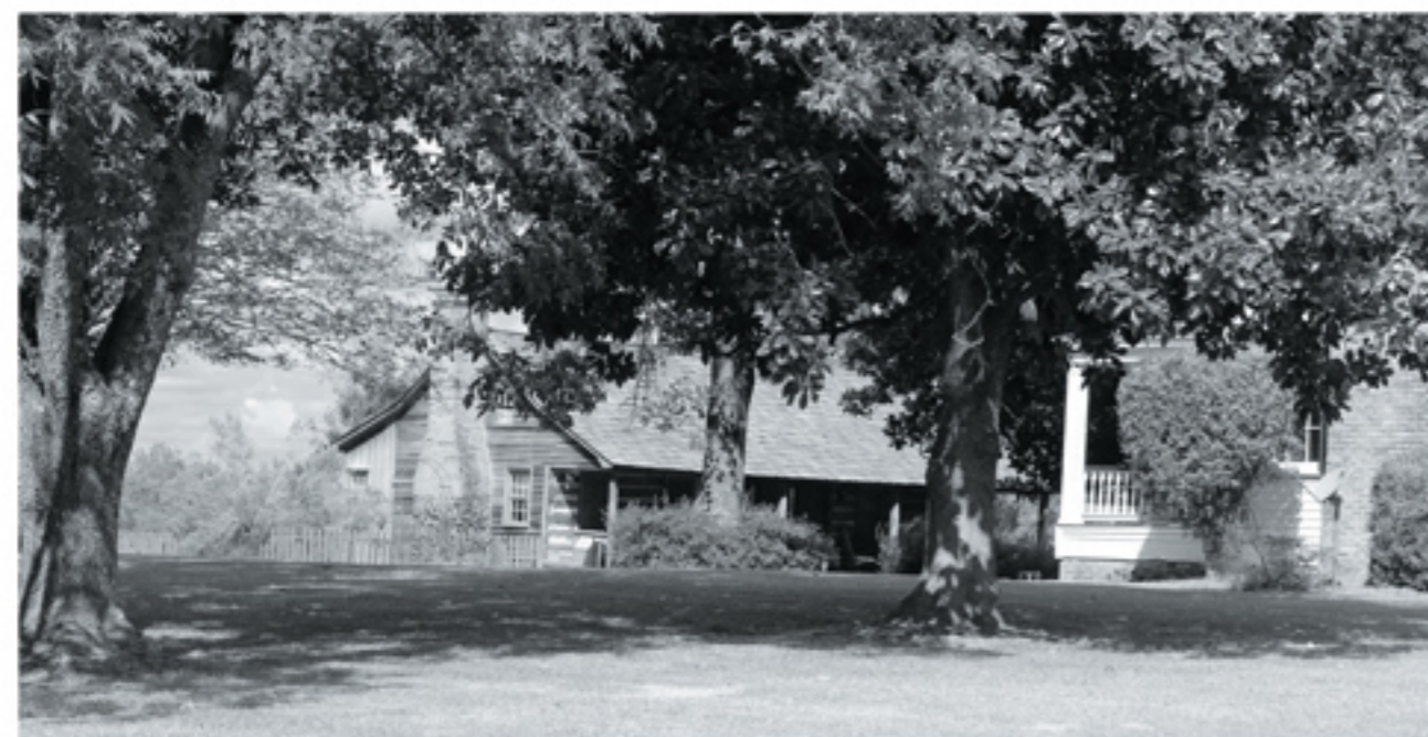
Slave house which still stands behind the big house.