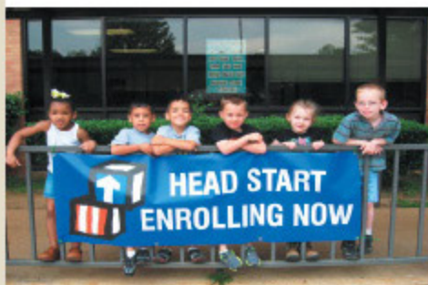
Rusk Primary School students. See information on page 7