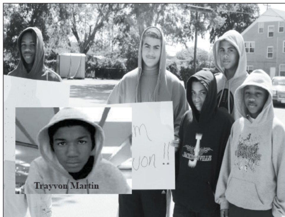
Local Jacksonville youth carry "I am Trayvon Martin signs.

Others told of encounters with local law enforcement. One man owns a farm truck and each time he travels into the town of Rusk he is stopped without cause.