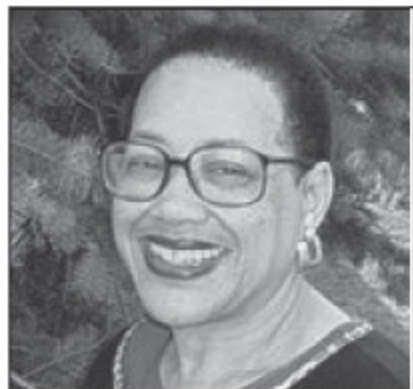
Charlene Crowell By Charlene Crowell NNPA Columnist

erms. This includes understanding when payment on the loan will begin, how interest is assessed, and what types of repayment options are available. Student borrowers in distress should also understand their legal rights. For example, there are restrictions on when and how debt collectors may contact a borrower.