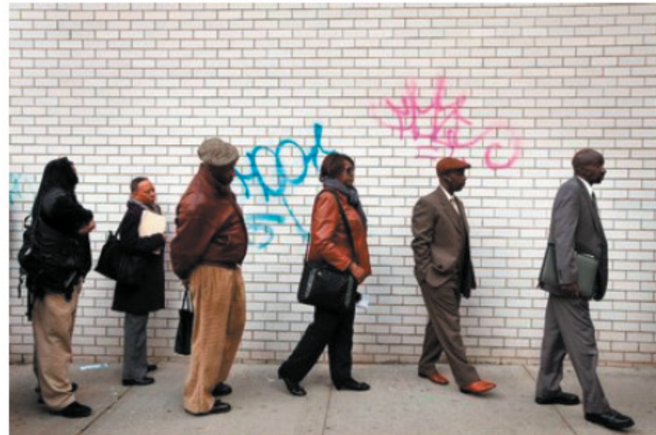
Unemployees lines around the states are long for African American

So why shouldn't Neo-Confederates raise their Rebel Flags, when we, in our silence, have already given them the victory. The devil is in the details.