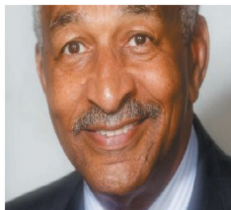
By Jim Clingman (NNPA Newswire Film Critic)

By the time you read this, I trust you will have wiped away the slime and the grunge, regurgitated a few times, taken a good bath or shower, relentlessly scrubbed the stench from your bodies, and maybe even found it necessary to delouse, because the dirty, filthy, hateful, distasteful, embarrassing, vile, toxic, grimy, polluted campaign we all witnessed is likely the worst in the history of electing a President.