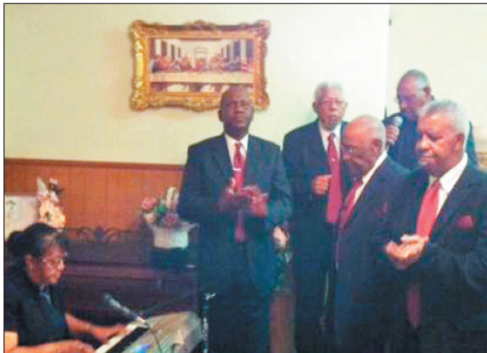
Mt. Enterprize Male Chorus as they performed at the musical.