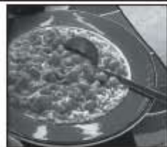
West African Groundnut Stew