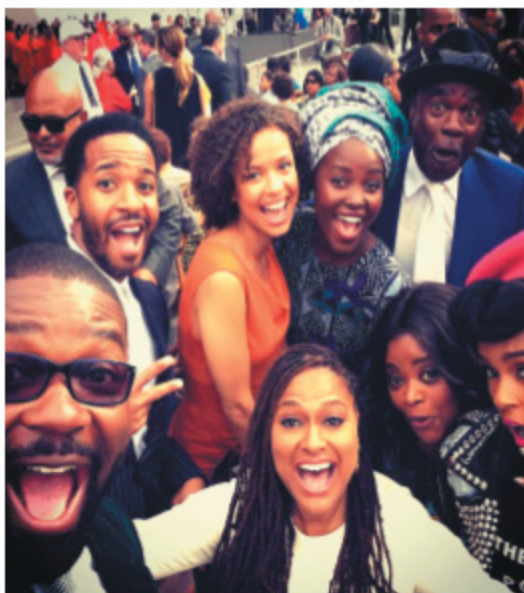
Celebrities attending opening

By Marian Wright-Edelman (President, Children's Defense Fund)