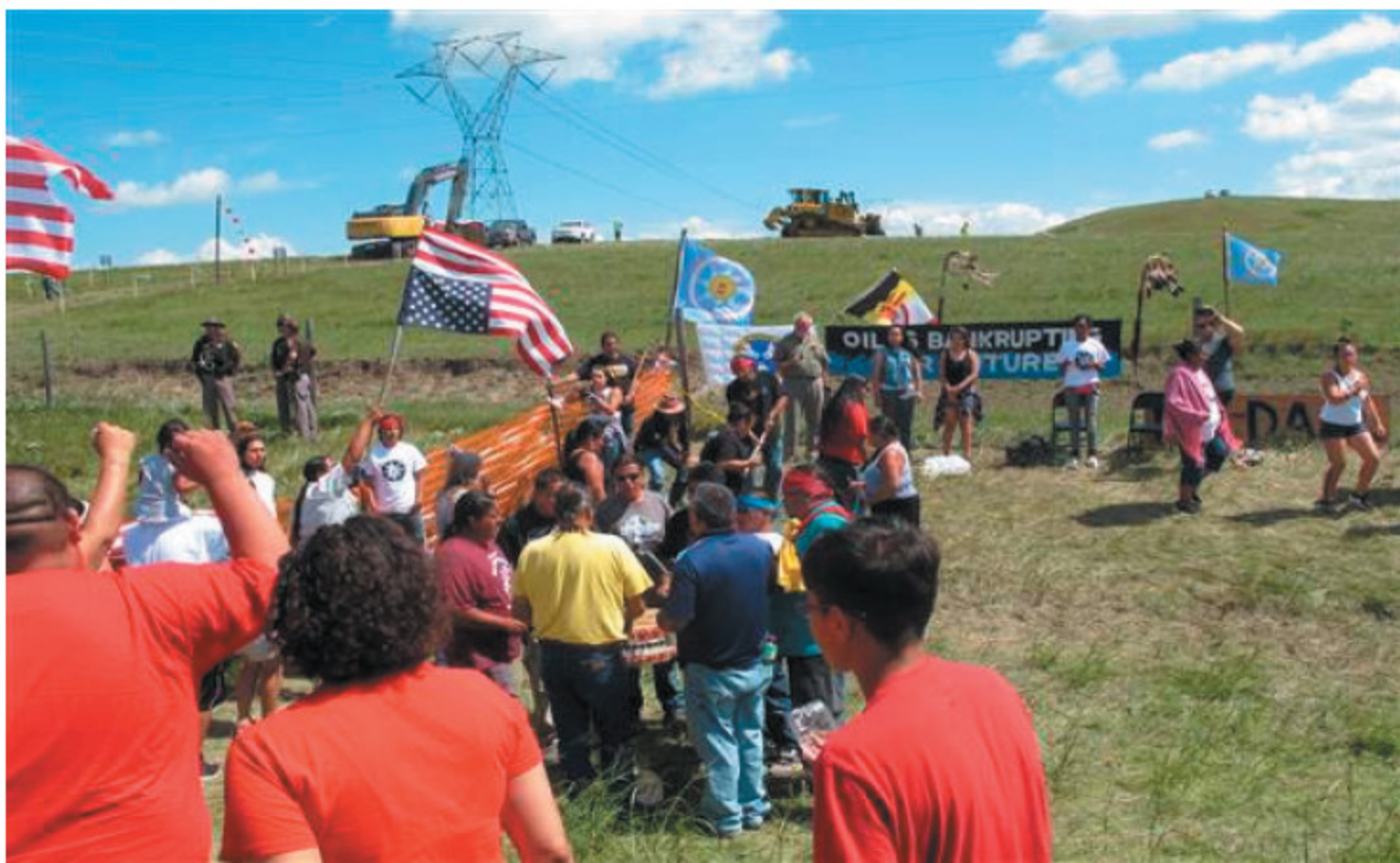
Contested site State Highway 1806 to the construction site. The pipeline would run just a half-mile from the Standing Rock reservation, which straddles the North and South Dakota border.