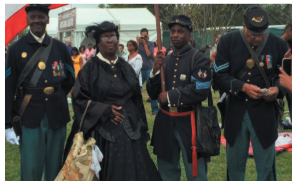
African Americans reenact the civil war in full dress