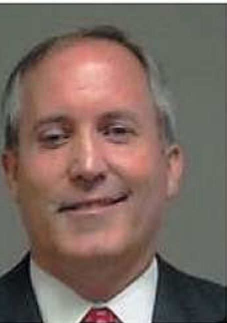
Texas Attorney General Ken Paxton

In the span of thirty days, federal judges have scuttled voter suppression laws in North Carolina, Texas, Wisconsin, Kansas and North Dakota, giving voting rights advocates a few, much-needed victories for the blood and sweat wrought in their court battles and protests since the controversial United States Supreme Court decision in Shelby v. Holder .