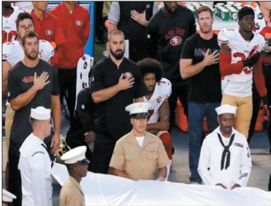
Colin Kaepernick refuses to stand during national anthem

National News - By refusing to stand during the national anthem, San Francisco 49ers' quarterback Colin Kaepernick is making an important, bold rebuke of police violence against Black people. Kaepernick joins a long history of Black athletes using their platforms to advance racial and gender justice issues - like Tommie Smith and John Carlos giving the Black Power