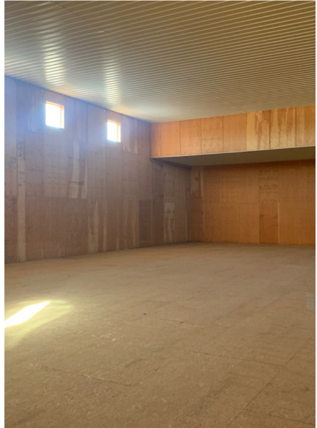
Above left: The Piatt County Museum barn as it stands at #1 Heritage Lane. Below Left: The concrete floor being finished in the barn. Right: The upper story of the barn. Long-term plans are to completely finish the interior of the structure to allow for the site to be used for display, educational and meeting space.

You can't miss the tall red roof of the barn when you're driving on I-72, and while it is not open to the public, we assure you that a lot is happening to move forward towards the goal of the site being host to Piatt County's significant agricultural and historical artifacts. The majority of the first floor in the large barn has been poured, allowing the larger rolling stock to be placed indoors and out of the elements, and up off of the previously gravel floor. This also creates more space in the education building where these items were previously housed, as we sort through and clean more collections. The upper story is wide open and offers so much potential for our vision of making it a place for displays, events and educational opportunities for the region. Piatt County has such a vast history and deserves to be remembered.