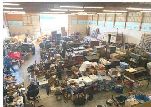
Right: A view from the loft of the education building, showing the quantities of boxes of collections. All items are inspected, cleaned, cataloged, and possibly repaired where needed, prior to being repacked and stored.