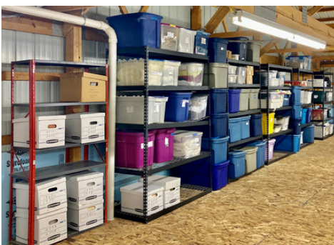
Left: New shelving and totes begin to fill the loft of the education building as the collections are cleaned, cataloged, and packed for safer storage.

In the education building, volunteers are going through the collections that have been stored in the in various containers and storage sites, which is no easy task in a building with no heat. Completed in early 2022, the office and restrooms of the education building allow volunteers to work longer, and better organization for the museum administration. The loft of the education building was constructed to create more storage opportunities, and get the items packed appropriately once they have been prepared.