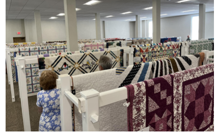
Above: Images from the 2023 Piatt County Museum Quilt Show, held in Monticello.