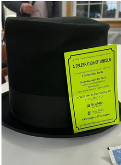
A Celebration of Lincoln took place in April.