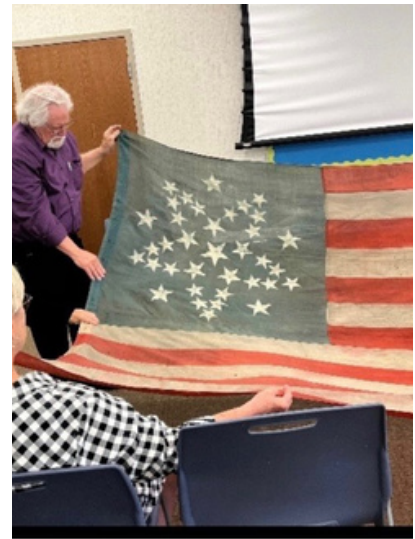
A flag donated by the Clodfelters is displayed.