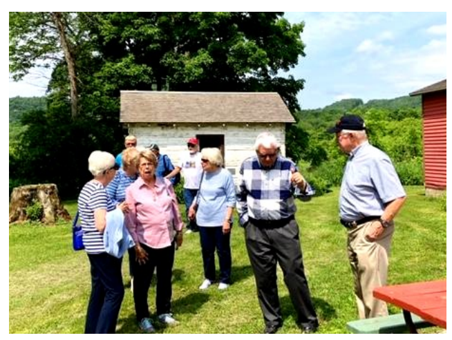
Kristiania members tour Thrunegaarden. The white building is the original log house built in 1853.