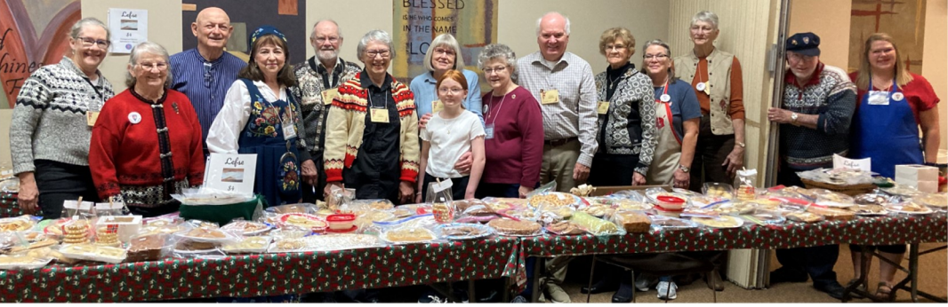
products. There were Boy Scouts volunteering also— in fact, they had the hall and common areas cleaned up and returned to order within 45 minutes after the sale closed.

Bake sale items and soup and sandwiches were nearly all sold out at around 12:30. Several craft vendors nearly sold out of their product, too.