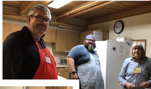
There were Sons of Norway volunteers everywhere! Some were directing traffic, providing membership information to curious patrons, buttering lefse, refilling the bake sale table, serving soup, totaling and bagging

By all definitions, our event was a success! Customers entered the hall in large numbers and patiently waited in line for baked goods and craft items. They also ate an early soup lunch beginning in the 10 o'clock hour.