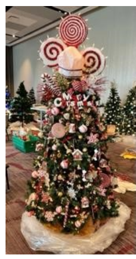
Kristiania 2022 tree