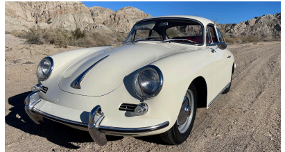
1963 Porsche 365B in Light Ivory "Louise" Owners: Dolly Samson and Gordy Hyde