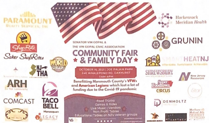
Event Graphic Displayed on social media.