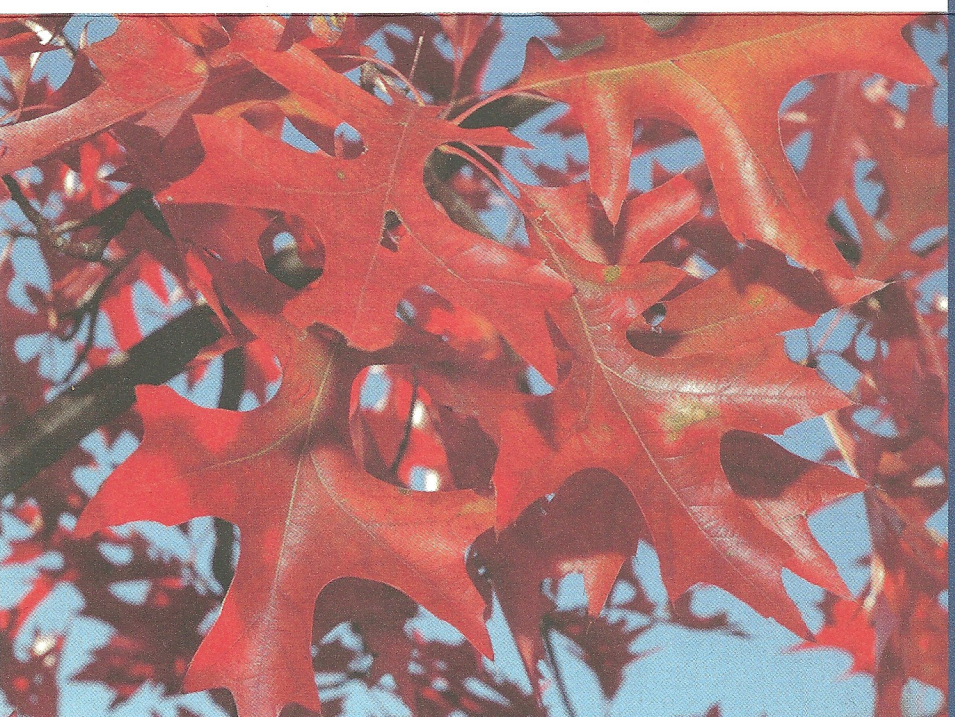
Scarlet oak, ( Quercus coccinea ) DC State tree