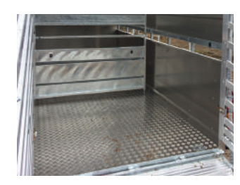
33mm timber floor with a one piece, fully sealed 3mm aluminium tread plate floor covering.