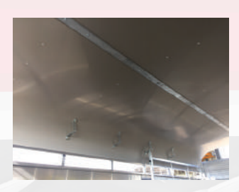
Tough central roof structure with edge retainer.