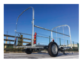
Chassis made from angle iron with a fully welded frame for maximum strength and endurance.