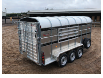
Tri axles are optional on 12 and 14 foot models and offer extra stability. Aluminium mudguards are standard on all tri-axle models.