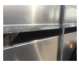
Incorporated box section for strength and reinforcement.