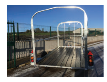
33mm preserved timber floor with aluminium treadplate for a fully sealed finish.