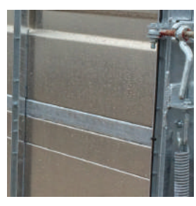
Closed in bottom vents.