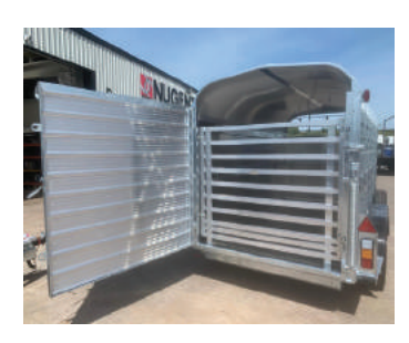
Single Door. Can also be used as a ramp.