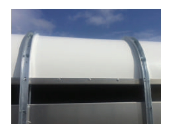
Aluminium spouting reinforces the roof.