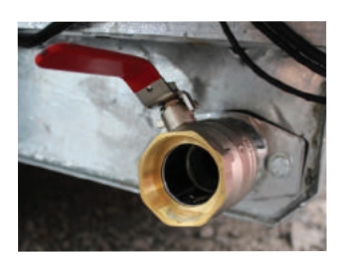
Collection tank lever valve allows for simple, safe and hygienic disposal.