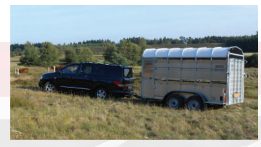
The Nugent 7 foot high option is suitable for transporting horses.