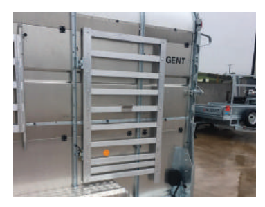
Additional pair of loading gates.