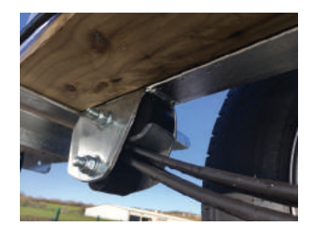
Dual Drive™ suspension.