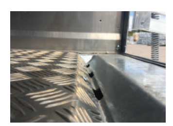
Metal collection tank designed for maximum efficiency.