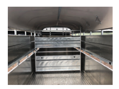
Additional dividing gate.