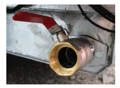
Collection tank— fully welded and sealed —hygienic disposal.