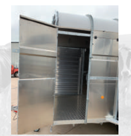
Open side door (not available with sheep decks).