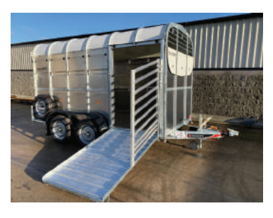
Front ramp door.