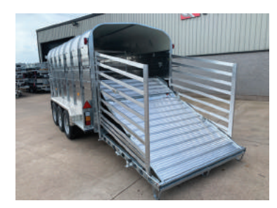
Fold-up sheep decks.