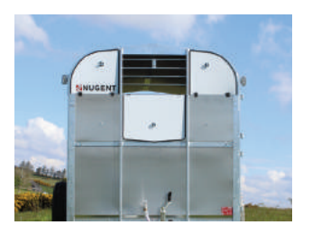
Sectional fold down front panels.