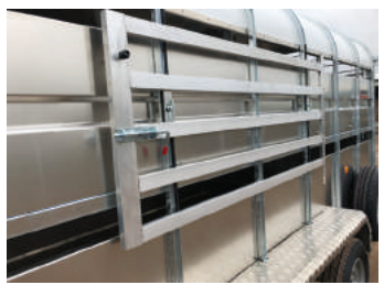
Fold-up sheep decks are conveniently and safely stowed for quick and easy access. They can be deployed without the need for any tools or special equipment. Dividing gates are supplied in both heights for when decks are in or out of use.