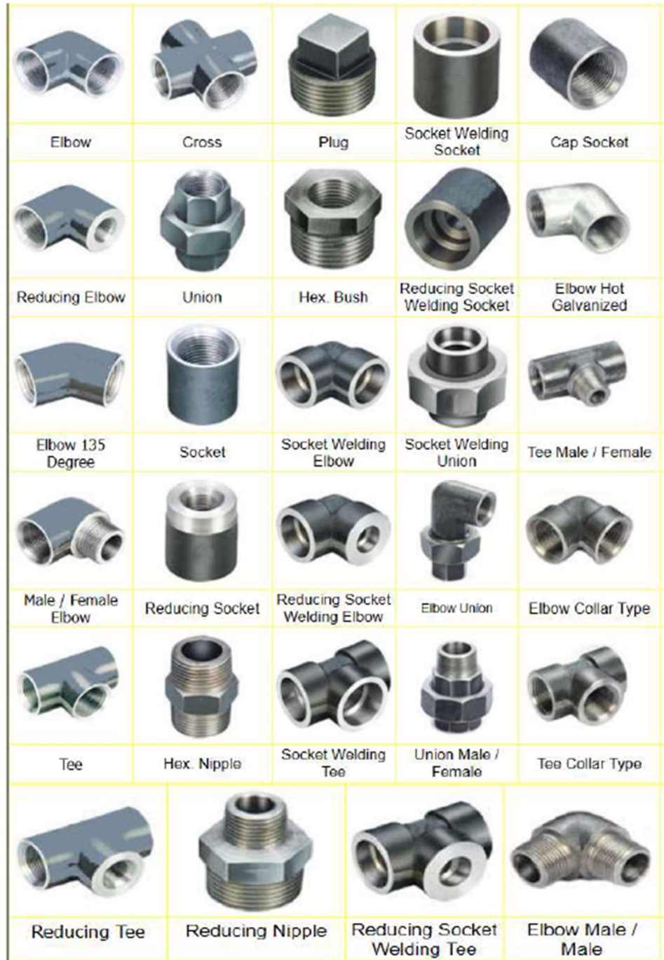
Various range of Pipe Fittings (MS & SS) With required Test Certificates.