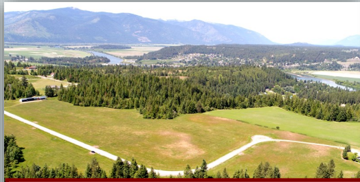
485 Stellar Jay 5.59 Ac Highest point in the neighborhood $400,000.00