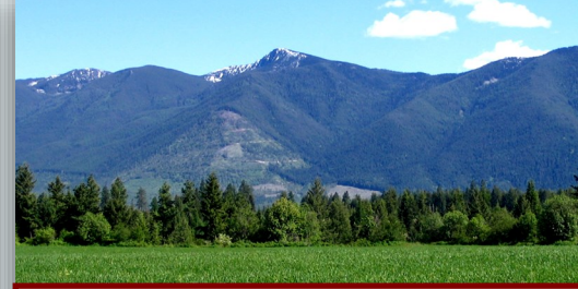
600 Stellar Jay 8+ Ac Mostly timbered with stellar views $300,000.00