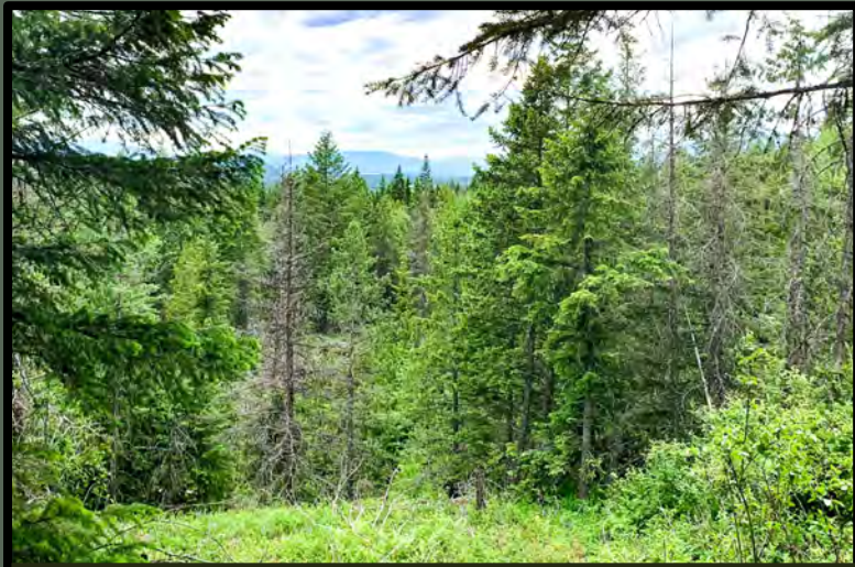
WEST GOLD CREEK RIDGE, SANDPOINT $365,000 Rolling Terrain and Meadows Remote Off Grid 20 Acres Filtered Views of Schweitzer Mountain