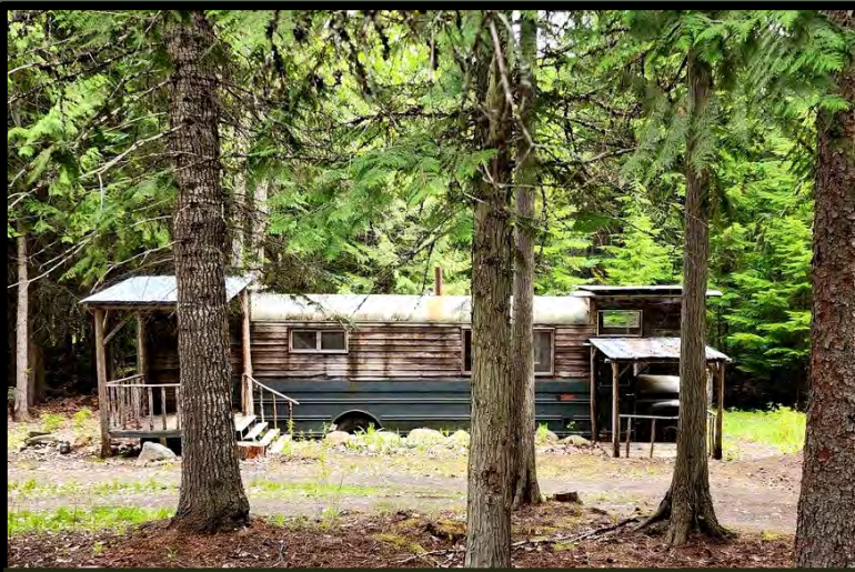
BETHLEHEM ROAD, BONNERS FERRY $200,000 Year Round Meadow Creek Runs Through 2 Off Grid Lots—8.62 Total Acres Homestead Cabin and '65 School Bus Included!

8 miles to Creston, BC in Canada for shopping, restaurants and wineries. Bootlegger & Continental Lanes and have electric and phone nearby. There are many proven wells in the immediate area.