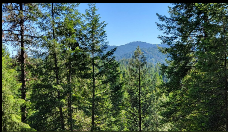
S. BOBSLED TRAIL, COEUR D'ALENE 40 ACRES $1,500,000 Utilities Close By, Good Wells In the Area Legacy Property with Amazing Views Above Wolf Lodge