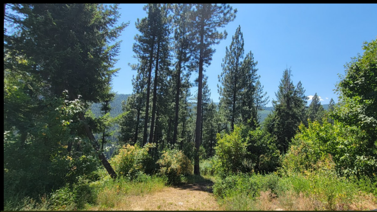
SNOWCAT LANE TRACT 4, BONNERS FERRY 10 OFF GRID ACRES $230,000 HIGH ABOVE SNOW CREEK FALLS USFS Lands Border to the North & South of this Property