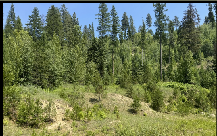
FALCON RIDGE DRIVE TRACT 2, NAPLES 10.83 ACRES $450,000 Seasonal Pond, Electric along Road Just Above Deep Creek and Deep Creek Loop