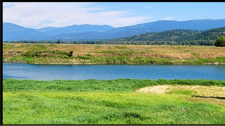
1168 SHIRE LANE, BONNERS FERRY 1.6 ACRES ON THE KOOTENAI RIVER $725,000 155 FEET OF PRIVATE SHORE LINE More Than a Homesite, A Way of Life