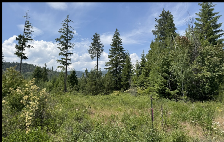
FALCON RIDGE DRIVE TRACT 1, NAPLES 10.6 ACRES $600,000 TRACT 2 10.83 ACRES $450,000 South of Deep Creek,-Private, Gated, Views