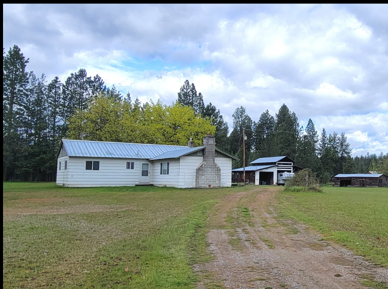
286 BLUME HILL RD, BONNERS FERRY $385,000 2640 SQ FT, 2 BED 1 BATH HOME Gardens, Barns & Chicken Coop on 3.41 Acres Nice Views & Minutes to Town!

If you do not find what you are looking for, tell us what your dream property looks like. We will let you know if any come available that might suit. We want to make buying real estate a pleasurable experience for you.