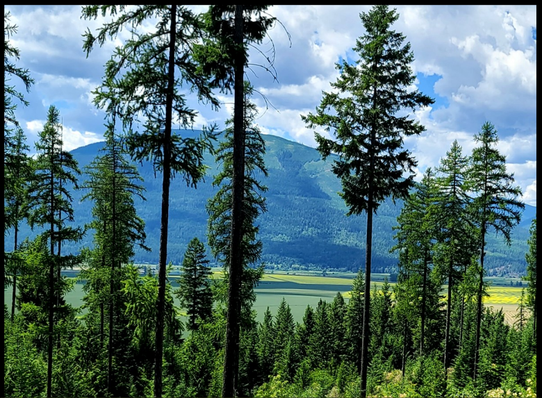
SMUGGLERS LANE TRACT 5 $315,000 10 ACRES ONE MILE FROM CANADA Electric and Phone along Private Road Just off Hwy 1, near Porthill with Amazing Views