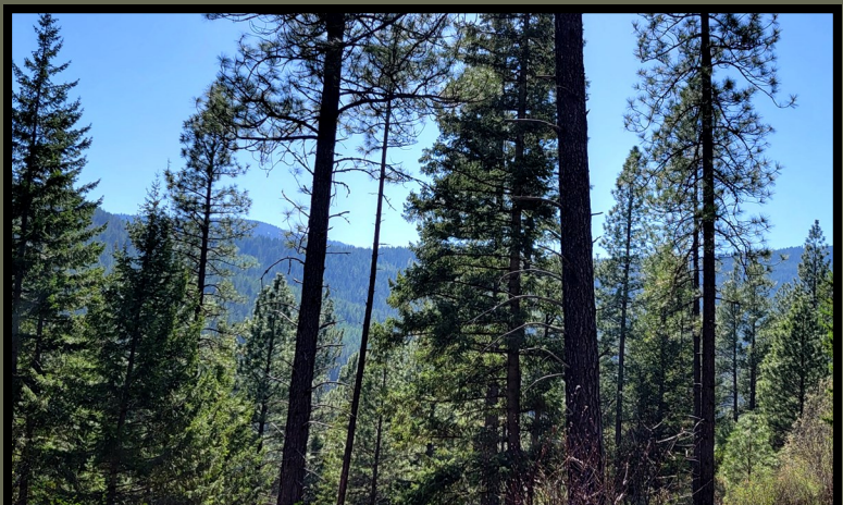
LOT 2 AND LOT 4 SNOWCAT LANE, NAPLES TWO 10 ACRES PARCELS $230,000 EACH Off-Grid Bordering USFS to North & South Gateway to Recreation or Build a Home!