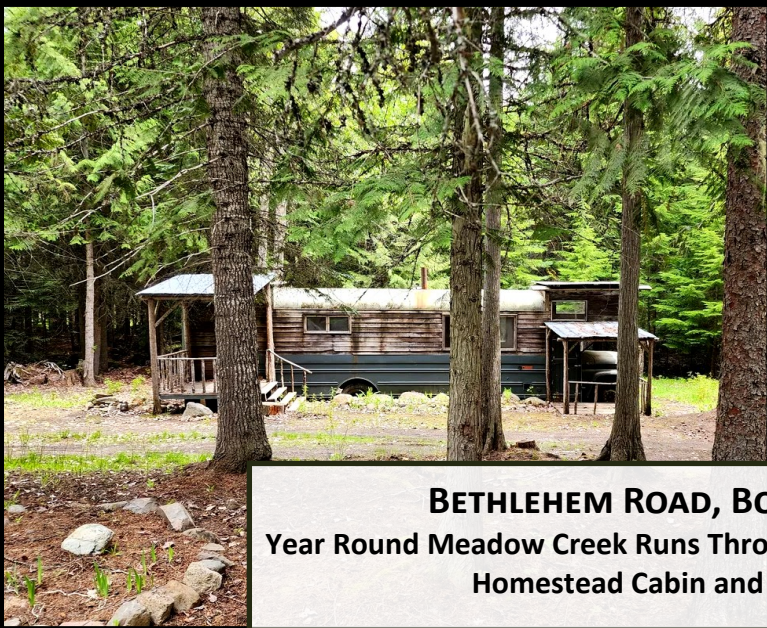
BETHLEHEM ROAD, BONNERS FERRY $200,000 Year Round Meadow Creek Runs Through It. 2 Off Grid Lots—8.62 Total Acres Homestead Cabin and '65 School Bus Included!