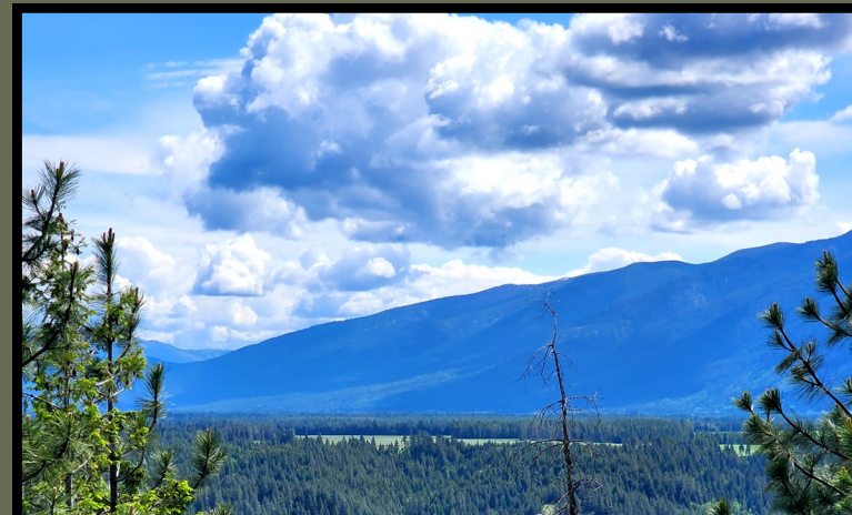
2114 JUNIPER LANE, NAPLES 80 ACRES—$749K OR JUST THE LOWER 40—$399K Roads, Well, Electric and Homesites are in Just Electric Available on the Lower 40 Acre Parcel