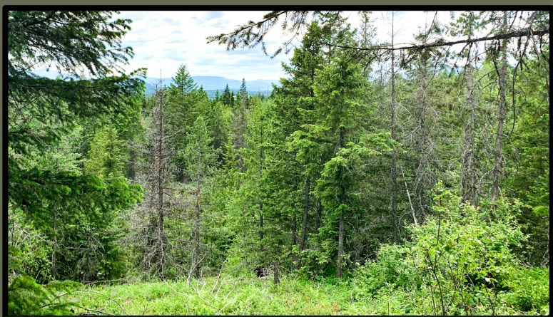
WEST GOLD CREEK RIDGE, SANDPOINT $365,000 Rolling Terrain and Meadows Remote Off Grid 20 Acres Filtered Views of Schweitzer Mountain