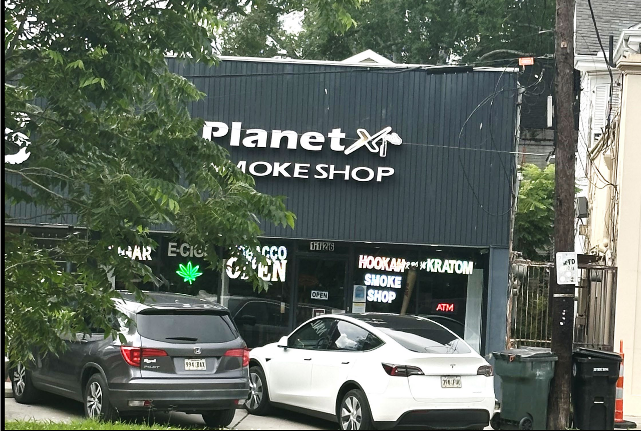
Surrounding Businesses and Signage in HU-B1 Neighborhood Business District