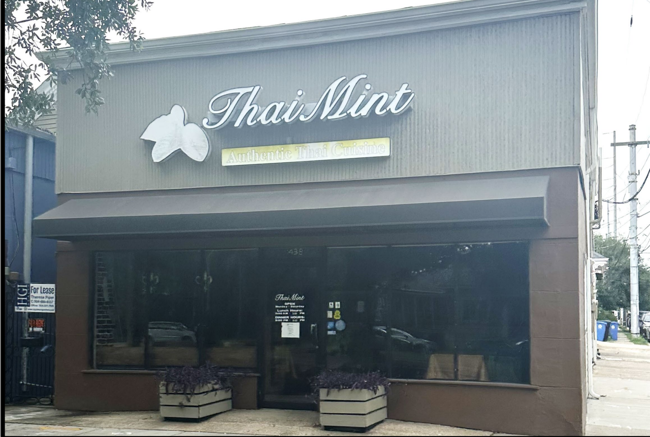
Surrounding Businesses and Signage in HU-B1 Neighborhood Business District