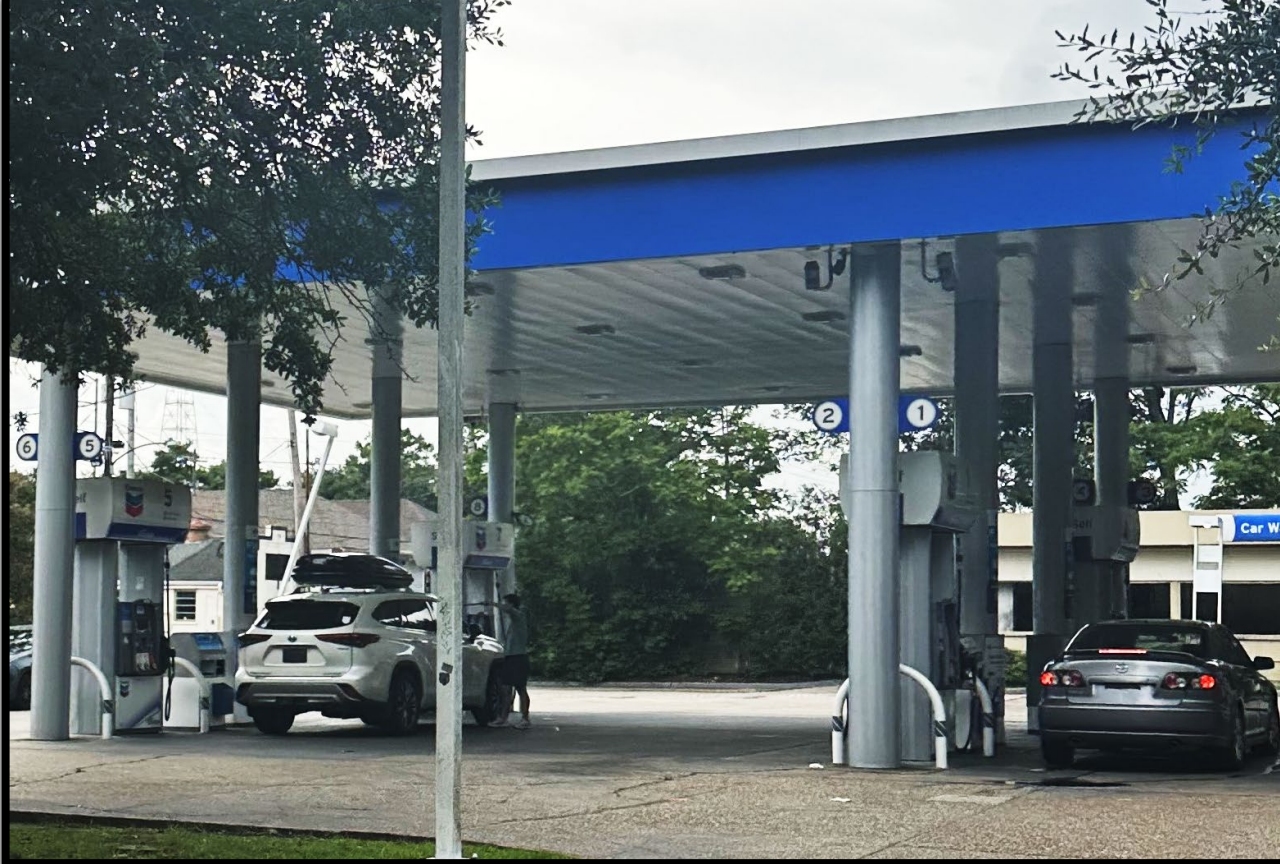
Surrounding Businesses and Signage in HU-B1 Neighborhood Business District