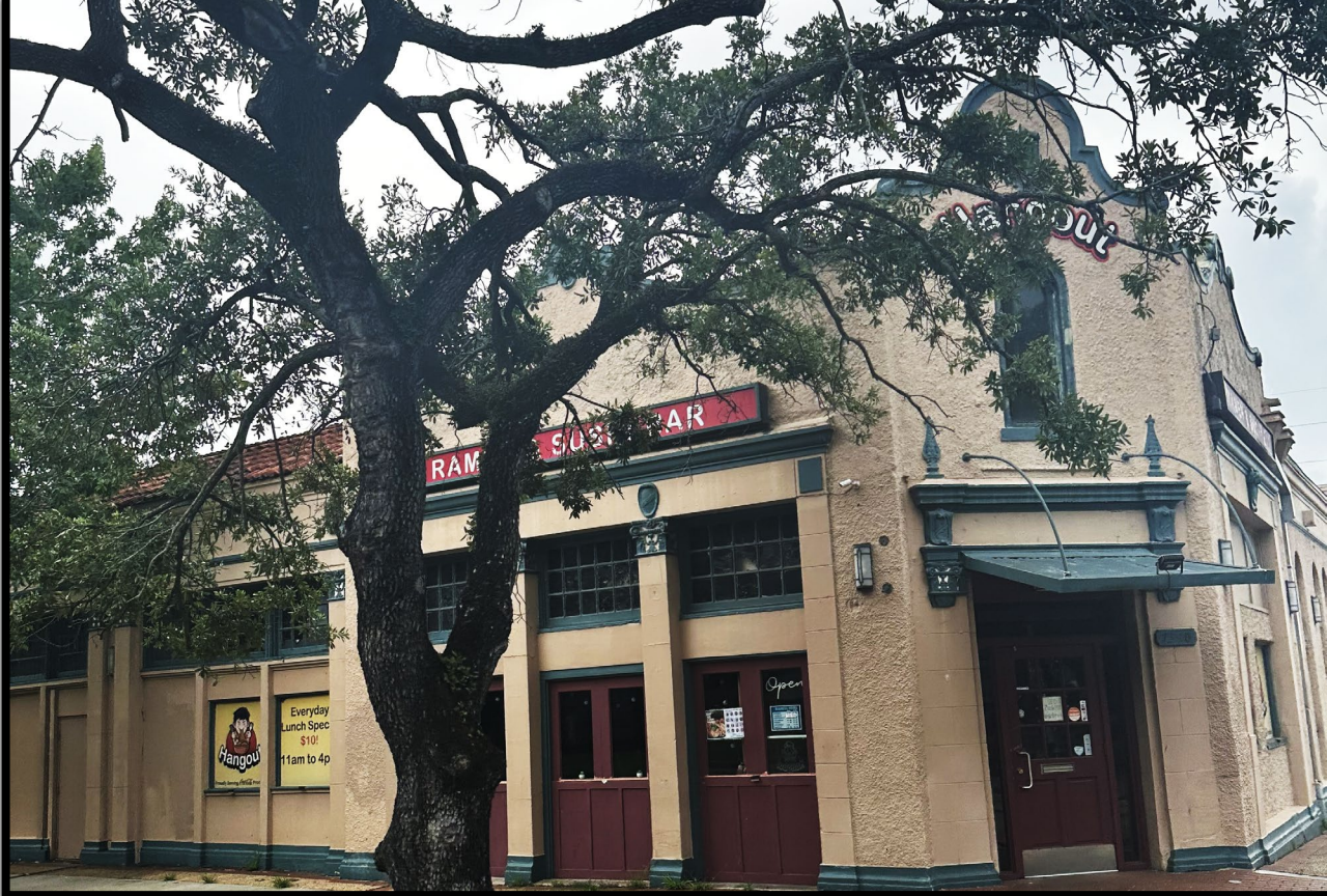
Surrounding Businesses and Signage in HU-B1 Neighborhood Business District