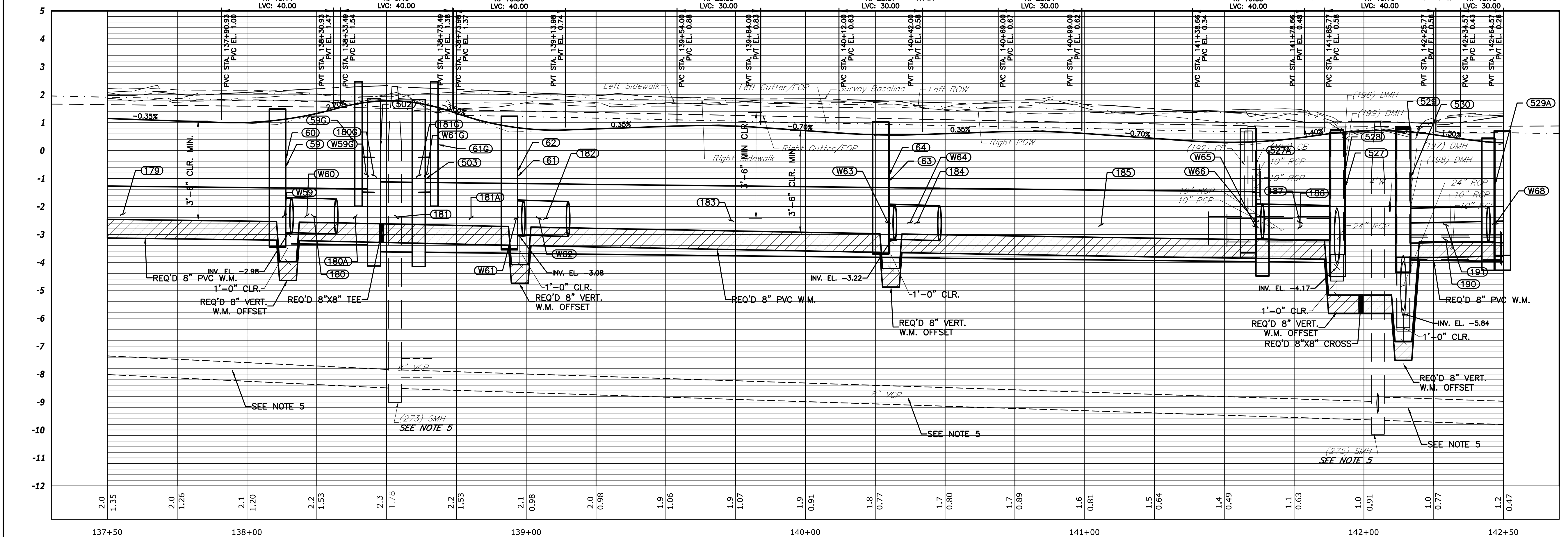
ADAMS STREET (STA: 137+50.00 to STA: 142+50.00) SCALE: 1"=20' HORIZ. / 1"=2' VERT.

BCG ENGINEERING & CONSULTING 3012 26TH STREET, METAIRIE, LA 70002 DESIGNED: BCG CHECKED: BCG SCALE: AS SHOWN DATE: 7/19/2022 SHEET: RR033-PLN-PRO-01