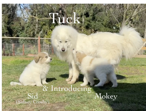
Tuck, Sid and Monkey