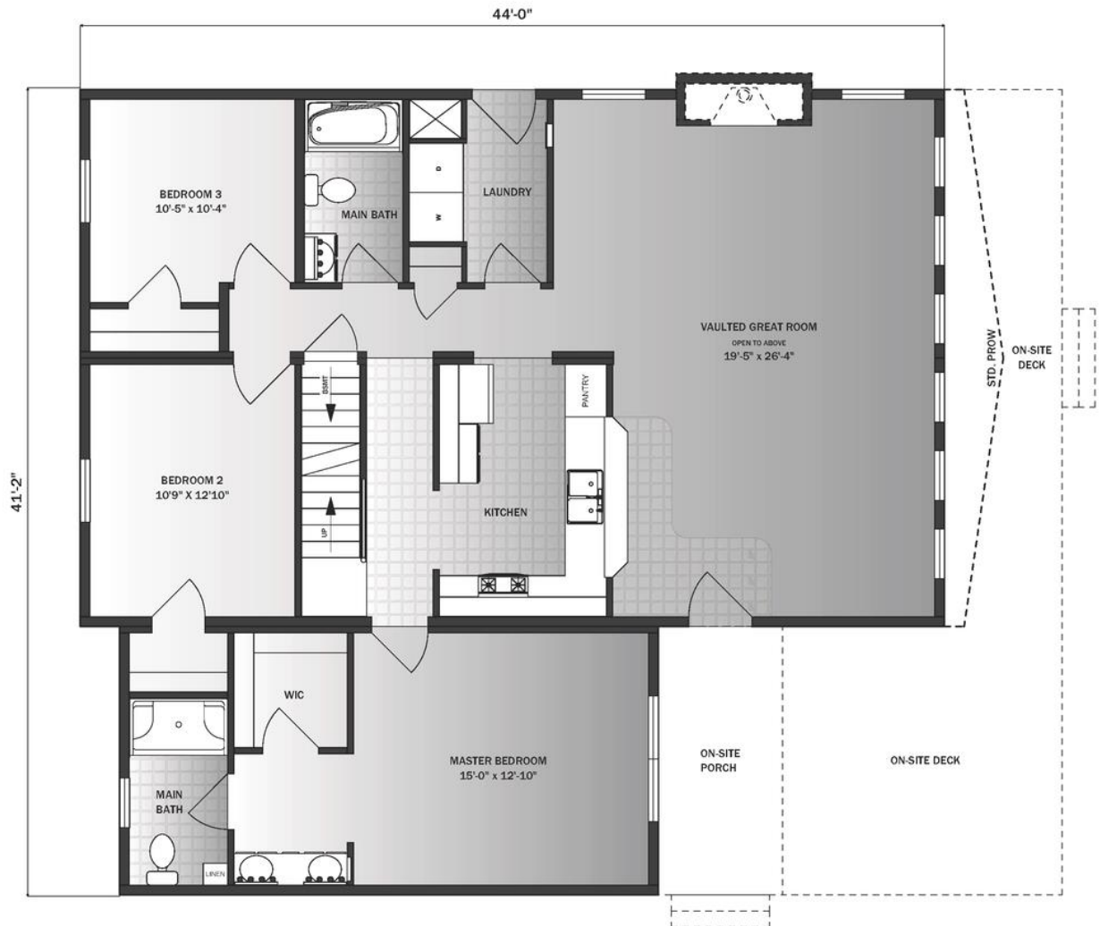
First Floor (1,580 sq. ft.)