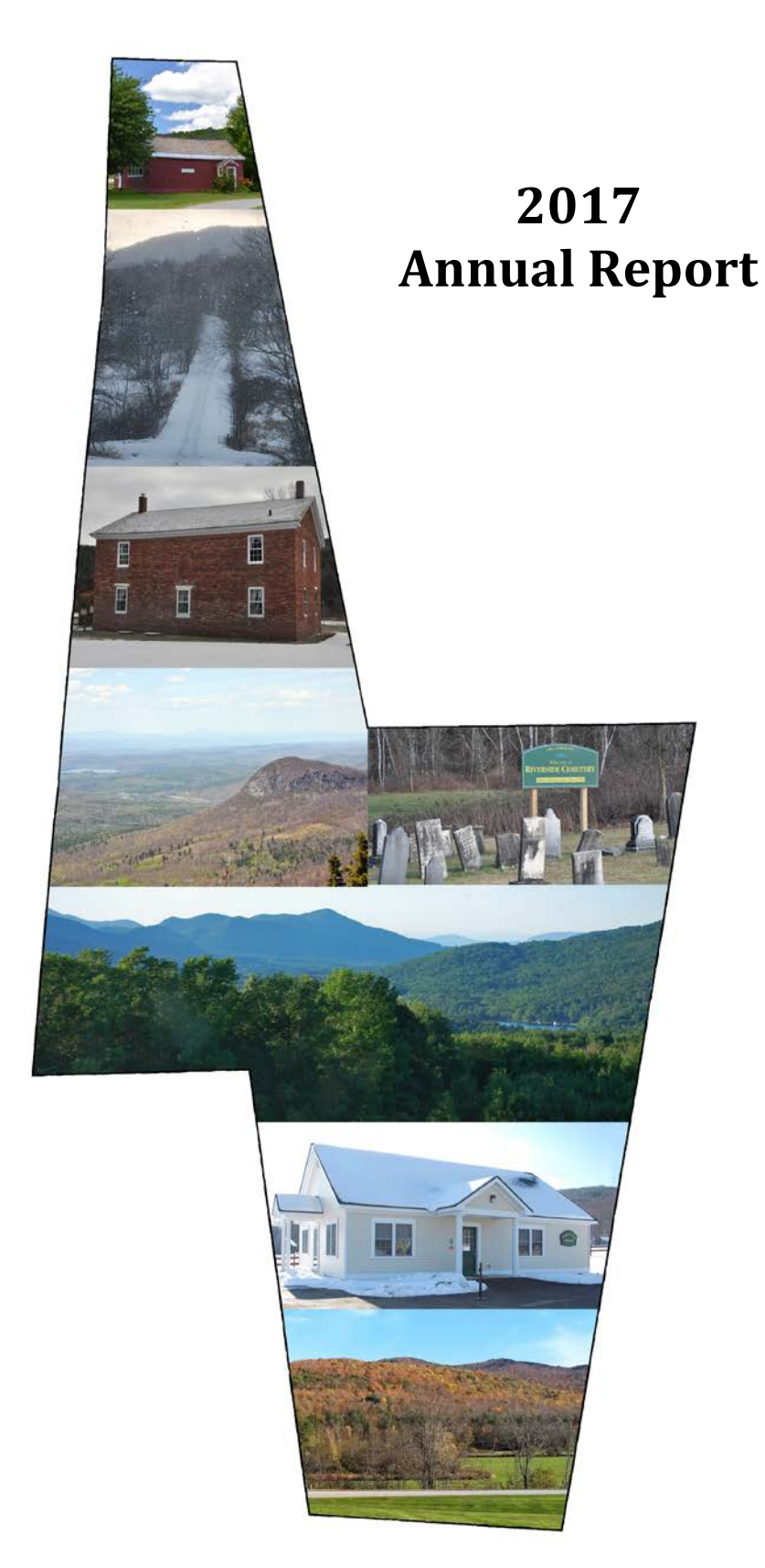
Town of Ira, Vermont