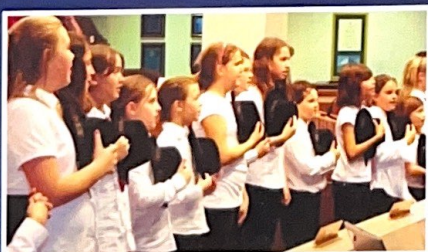
Members of the Roosevelt Elementary Chorus, Encore , perform for School Board members before the Proclamation on February 23rd.

During Music In Our Schools Month (MIOSM), many exciting events will be taking place to recognize the importance of school music programs. The World's Largest Concert is a sing-along event, this year taking place worldwide on March 11. The World's Largest Concert is the marquis event for MIOSM. Music for the World's Largest Concert is inspired by the MIOSM theme, "Music! Just Imagine..."