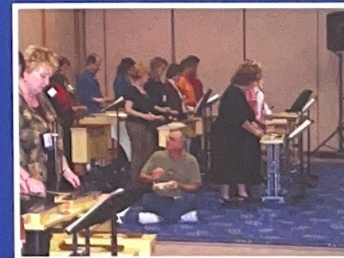
FMEA Clinic-Conference Hillsborough music educators, and teachers from across Florida, participate in sessions of the FMEA Clinic-Conference.

The 2009 Young Songwriter's Symposium featured students from Morgan Woods, Tampa Bay Boulevard, Turner, Hunter's Green, Westshore, Egypt Lake, Oak Grove, Seminole, Simmons, and Springhead Elementary Schools.