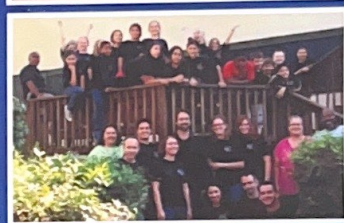
Young Songwriter's Symposium Participants

The 2009 Young Songwriter's Symposium featured students from Morgan Woods, Tampa Bay Boulevard, Turner, Hunter's Green, Westshore, Egypt Lake, Oak Grove, Seminole, Simmons, and Springhead Elementary Schools.