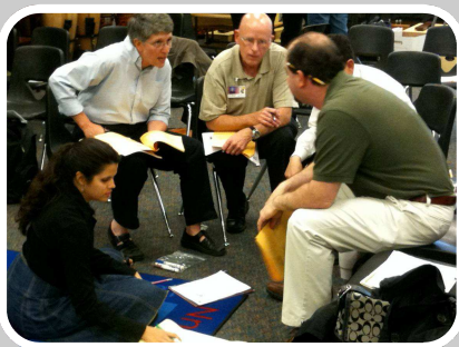
Hillsborough Music Specialists discuss strategies during a recent cross-curricular training.