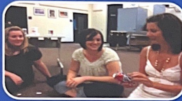
Music Specialists participate in professional development during the summer.