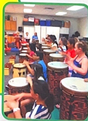
Summer Music Camp participants at Bryant Elementary