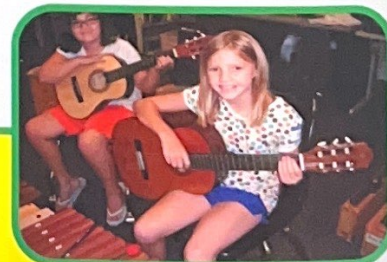
Summer Music Camp participants at Bryant Elementary