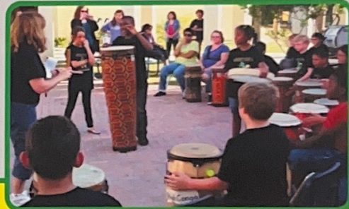
Above, students and families from Davis Elementary participate in the First Annual Drum Night.