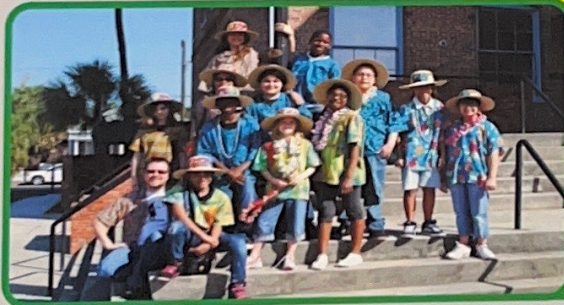
Left, students from the Philip Shore Steel Pan Ensemble, Panacea

Philip Shore Elementary School was privileged to be a recipient of a grant in the amount of $145.00 to procure new mallets for their steel pan ensemble. Panacea is Philip Shore's staple ensemble, performing many concerts throughout the school year within the community. With the grant, students at Philip Shore were able to procure brand new steel drum mallets for their ensemble, which were much needed. Their previous mallets were very old and literally falling apart, and could not withstand any more "band-aiding." With their new mallets, they now have the proper equipment to perform on their instruments, and will last for years to come. Thank you to the HCEMEC for fulfilling Panacea's need for new mallets.