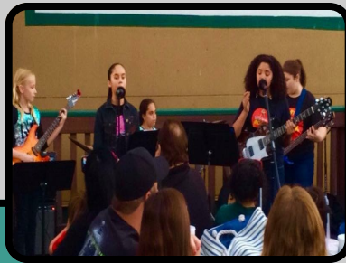
Canella Elementary, left, and Lewis Elementary participate in the Beef O' Brady's Spirit Week to benefit Little Kids Rock