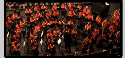
Fine Arts Festival Honors Orchestra

We take the drums to the balcony to prepare for the finale. I get the students in position and we are ready. We rehearse the finale with the three choirs, Orchestra, Orff and Handbell ensembles. I fix a few problems and it is time to be dismissed until tonight for the festival. Six p.m. arrives faster than I could have imagined and it is time to greet my honor drum friends. They are all dressed in their daisy yellow shirts and black pants ready for the evening. Once everyone is here we run up the stairs to practice the finale one more time, and then bring the drums downstairs to put them in place for when it is our turn to perform. Next we go to our dressing room and wait...and wait. Try keeping 35 drum students quiet when they are waiting to perform! We go and see the art work in the lobby to get the wiggles out, make one last call for the restroom, and then it is our turn to perform. As we are waiting in line outside the door I tell my drum friends to rock this out. They are ready and it is now time to jam! We go in the hall, sit down, and all eyes are on me. I take a deep breath and here we go! We all finish with a bang in the middle of the drums and there is silence, then the audience goes crazy! They loved what we just played! The students and I are glad that is over and now we can really get our groove on for the second piece.