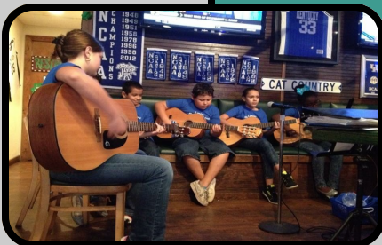
Lanier, above, and McDonald Elementary participate in the Beef O' Brady's Music Education Spirit Week