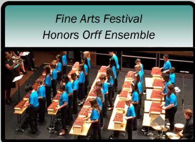
Fine Arts Festival Honors Orff Ensemble