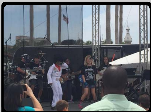
Chiles' Rock Band rockin' the Curtis Hixon Stage at Tampa RiverFest.