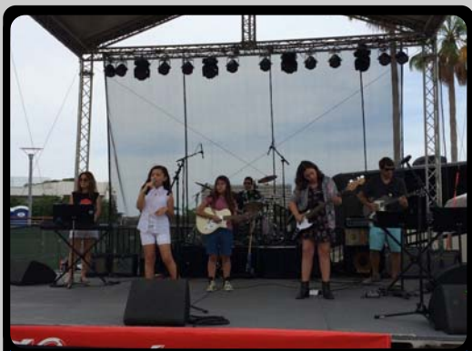
The Kingswood Elementary Rock Band performing at Tampa RiverFest.