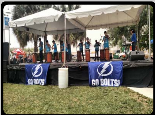
MacFarland Park Strings perform at the Tampa RiverFest.