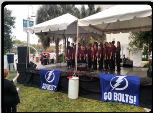
Schwarzkopf Freedom Singers perform at MacDill Park for the Tampa RiverFest.