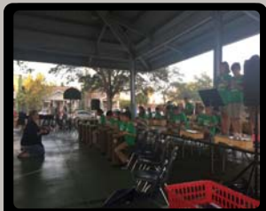
Bevis Broncos Orff Ensembles