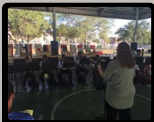
Philip Shore Chamber Orchestra

The 9th Annual Elementary Multicultural Music Festival was held on January 20, 2017 at Philip Shore Elementary Magnet School for the Arts. The festival included performances from 9 different school with 240 students performing!