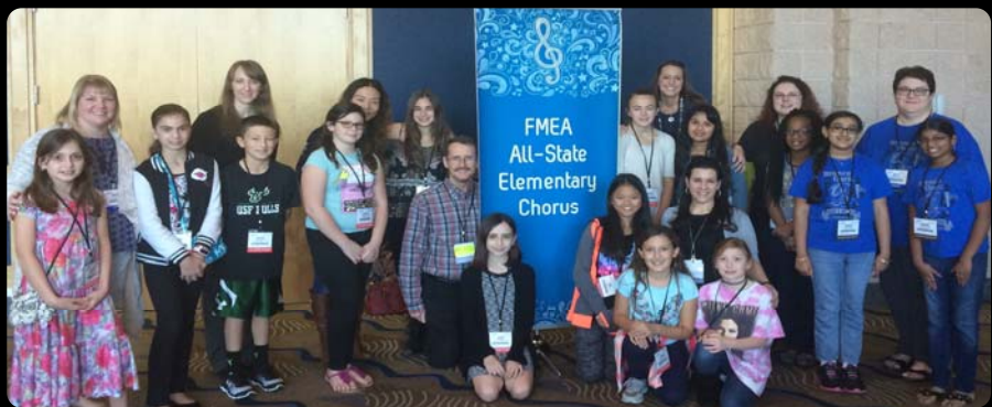
Hillsborough County Schools' FMEA All-State Elementary Orff Ensemble and All-State Elementary Chorus Participants