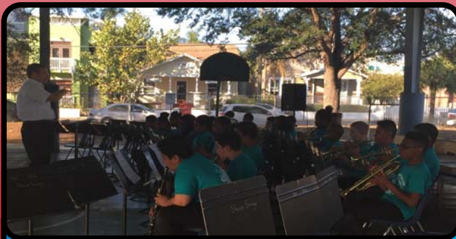
The Ippolito Otter Band at the Multicultural Festival