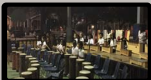
Dunbar Beats And Orff Jammers