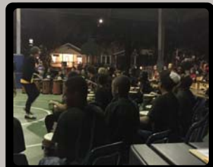
Kimbell Paw Crushin' Orff and Drums