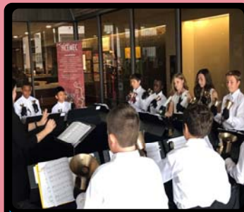
The Roaring Ringers of Limona Elementary performed before the School Board meeting.