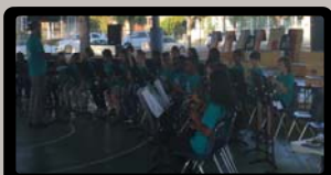
Seminole Heights Soaring Eagles Band

Elementary Music Ensembles participating in the 2017 Multicultural Festival: Philip Shore Chamber Orchestra Dunbar Beats and Orff Jammers Kimbell Paw Crushin' Orff and Drums Roland Park Dragons with Mallets Bevis Broncos Orff Ensembles Sessums Stallion Thunder Springhead Pioneer Band Ippolito Otter Band Seminole Heights Soaring Eagles Band