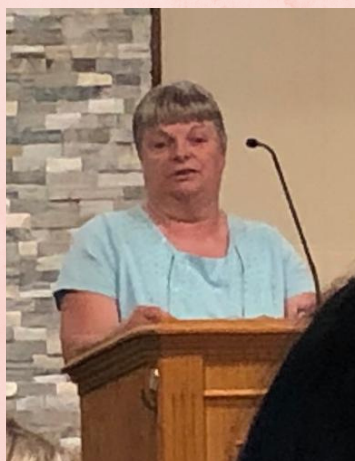
PAM- MINISTRY OF FOOD AND CLOTHING DISTRIBUTION