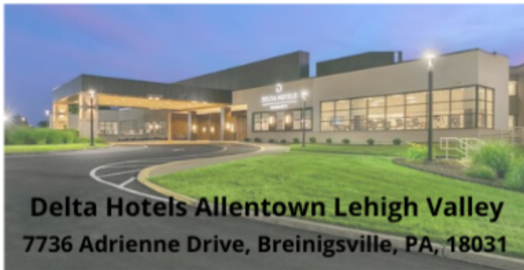
Delta Hotels Allentown Lehigh Valley 7736 Adrienne Drive, Breinigsville, PA, 18031