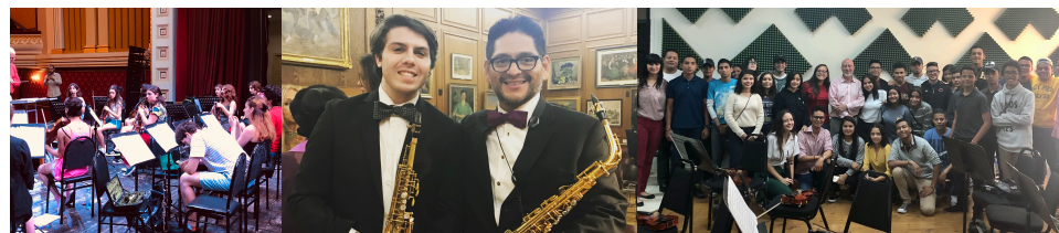
Tbilisi festival orchestra Tbilisi, Georgia

Support the sound. Join the celebration. Let's make the next 10 years even more unforgettable!